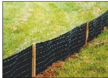
Properly installed silt fence, buried at the base.

“Areas of exposed soil will be covered with at least 2 inches of hay at the end of each work day. Permanent seeding and/or mulching will be completed within three days of the conclusion of the project.”