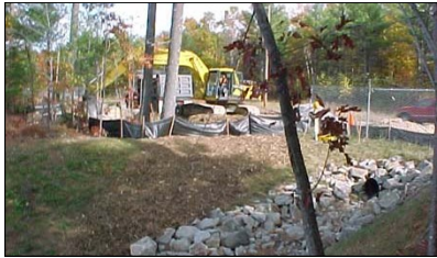
The E & S Plan must be well-designed and carefully followed by the contractor.

You can have an E & S Plan prepared by your contractor or other professional or you can prepare it yourself .