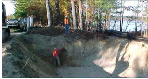
E & S measures must be inspected daily as the project proceeds