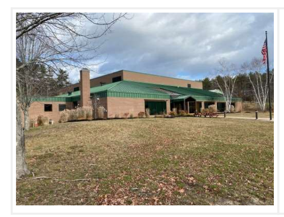
Metal roof overview.