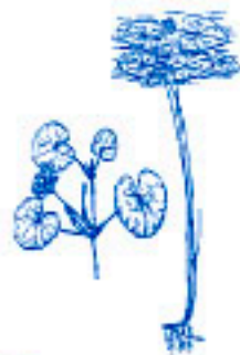
YELLOW FLOATING HEART ( Nymphoides peltata ) 5