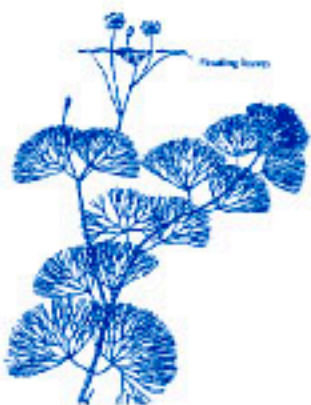
FANWORT ( Cabomba caroliniana ) 3