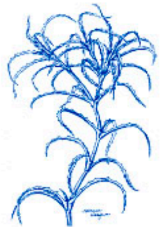
EUROPEAN NAIAD ( Najas minor ) 2