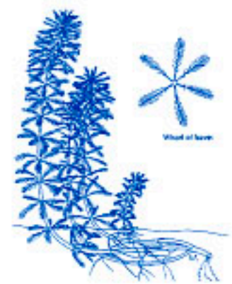
PARROT FEATHER ( Myriophyllum aquaticum ) 1