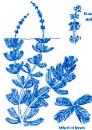
EURASIAN WATERMILFOIL ( Myriophyllum spicatum ) 1