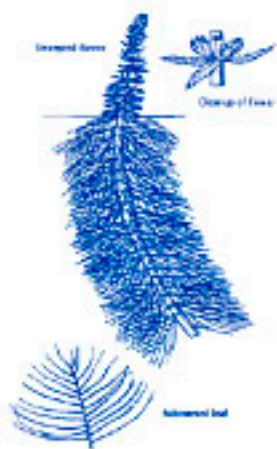
VARIABLE-LEAF WATERMILFOIL ( Myriophyllum heterophyllum ) 3