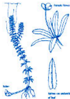
HYDRILLA ( Hydrilla verticillata ) 1